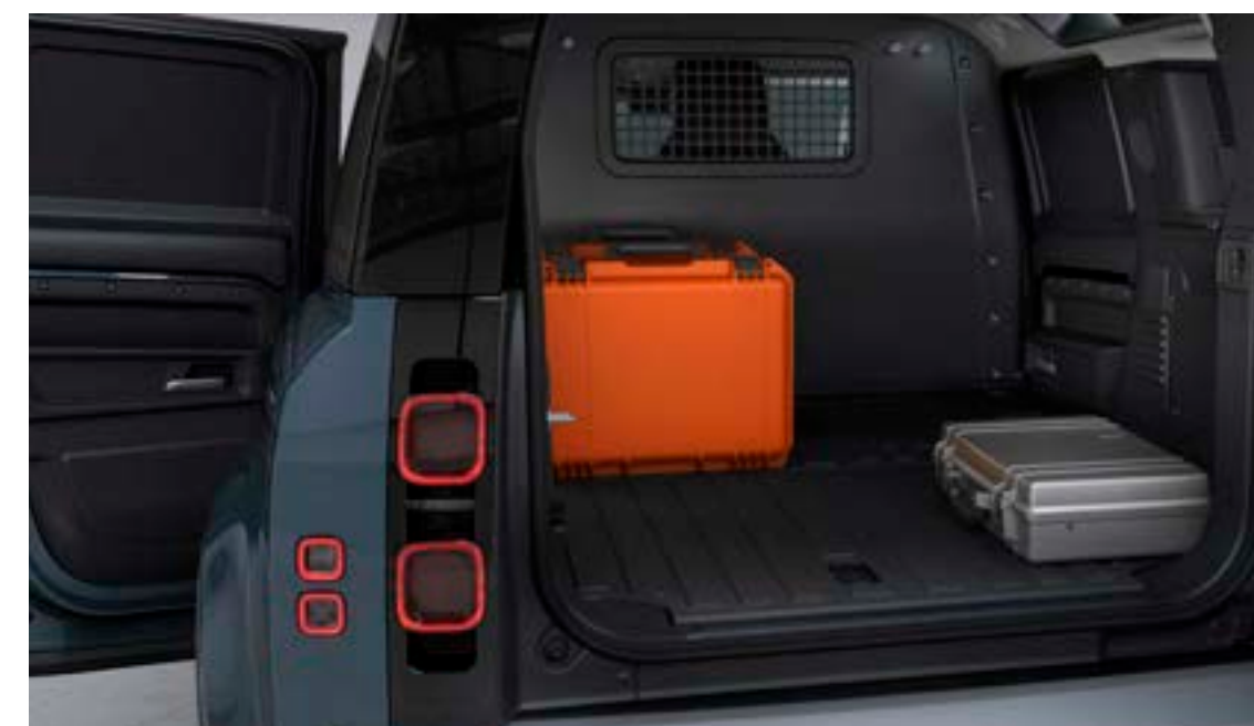
DEFENDER 110 HARD TOP