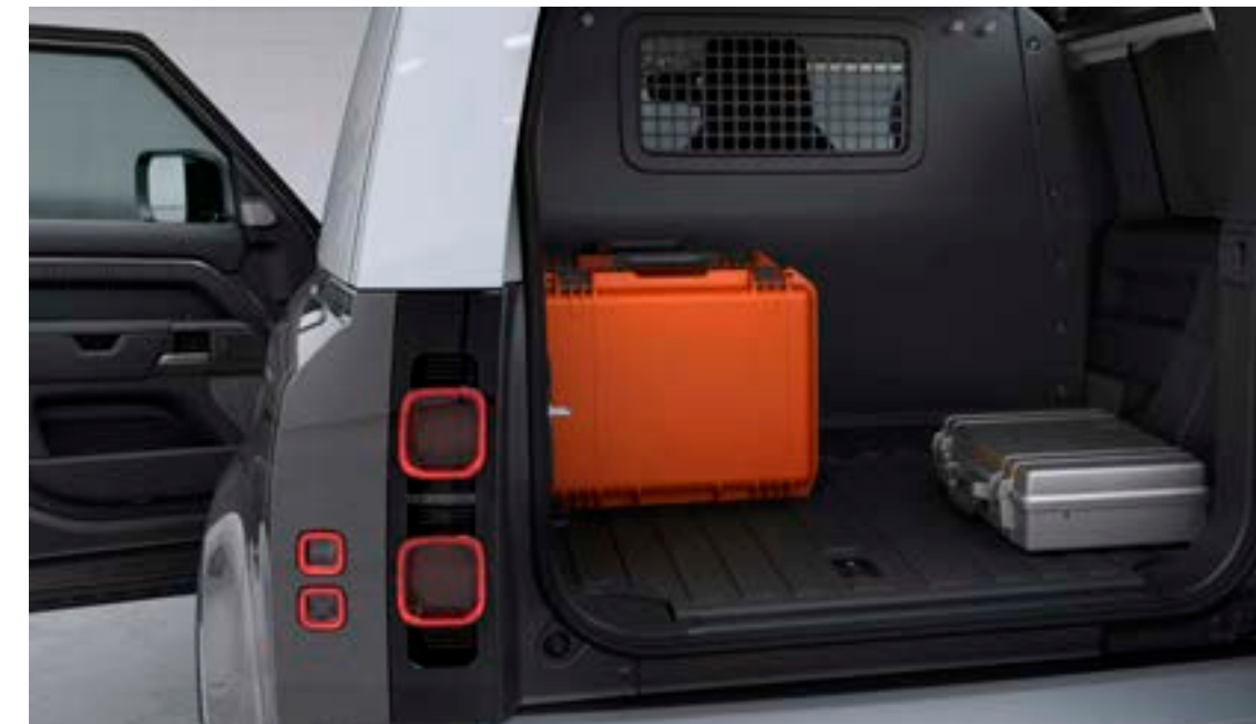
DEFENDER 90 HARD TOP