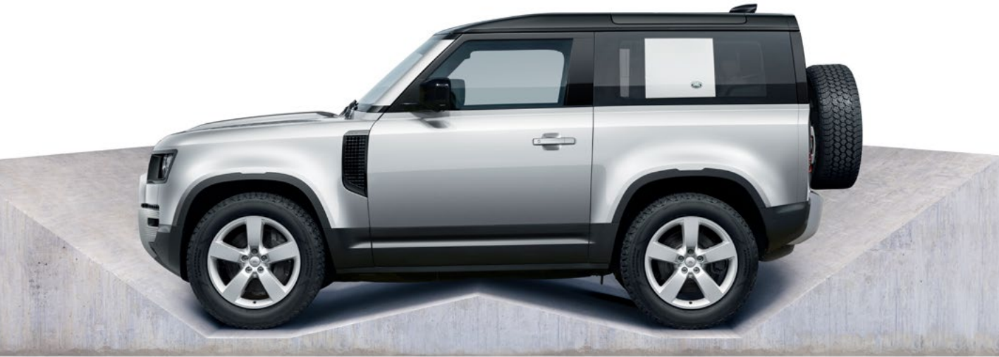
Overall Length 4,583mm (4,323mm without Spare wheel)