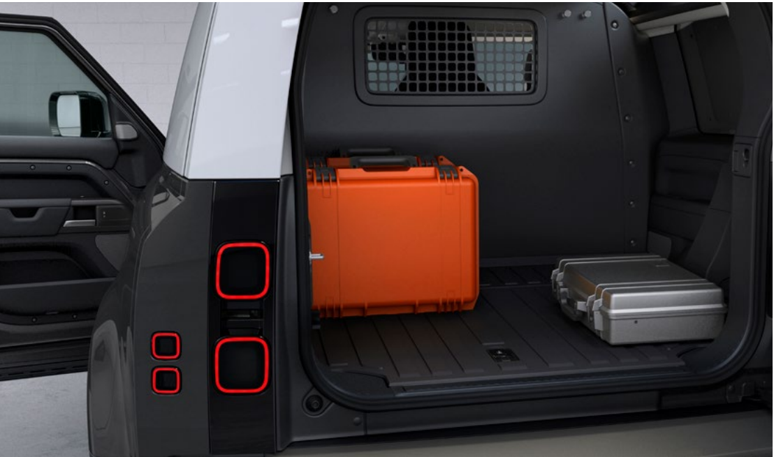
DEFENDER 90 HARD TOP