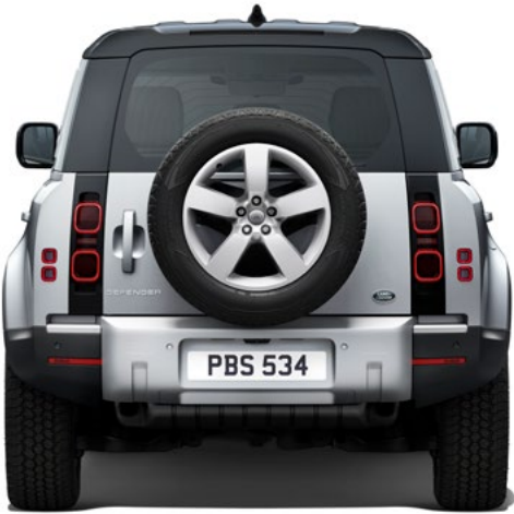
Rear wheel track Air Suspension 1,702mm † Coil Suspension 1,700mm ††