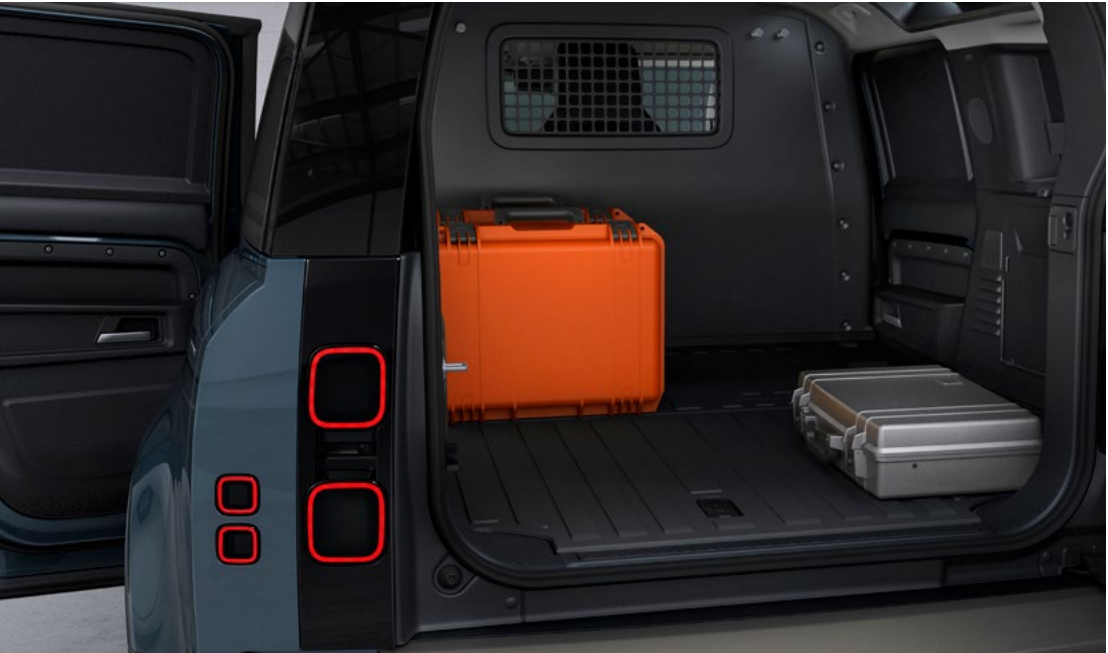
DEFENDER 110 HARD TOP