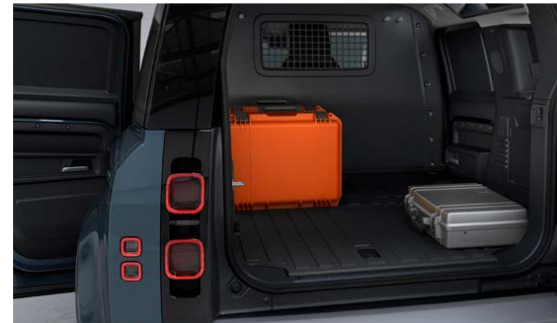
DEFENDER 110 HARD TOP