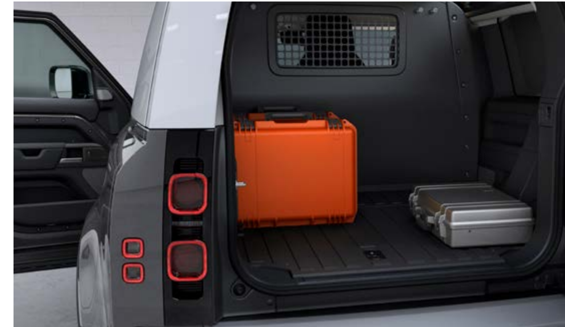
DEFENDER 90 HARD TOP