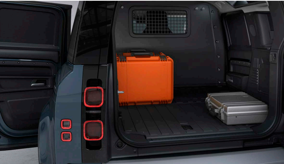
DEFENDER HARD TOP 110