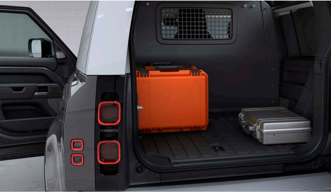
DEFENDER HARD TOP 90